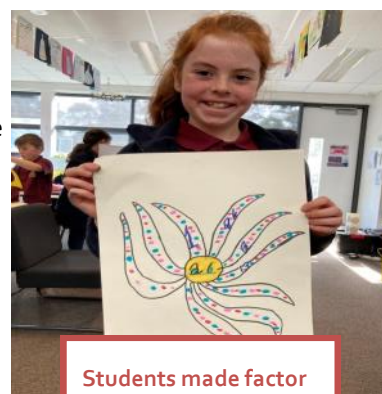
Students made factor flowers (or octopuses)

In the first couple of weeks of Term Three we have been learning the six and eight times tables. In Term One, we had a focus on revisiting times table facts that we had learned last year. Now, the only times tables that we have left to study are the seven and nine times tables. We have been looking at patterns in the tables, playing fun times table games on the computer and discussing ways to work out unknown table facts from the ones we do know. Next term, tables and their related division facts will continue to be a focus for our homework. Our main focus in Mathematics lessons this term has been subtraction, division and multiplication, we even learned what factors are! We have also learned about the Statistics and Probability topic of chance. We learned about chance events - how to order them, what outcomes are and whether an event is dependent or independent.