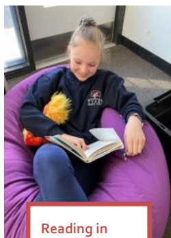
Reading in Style