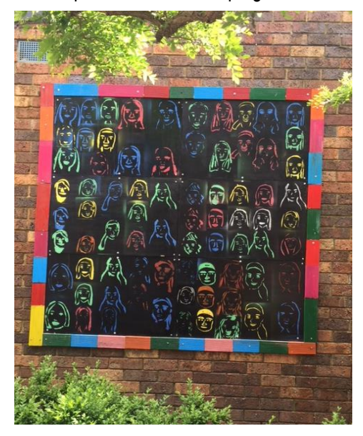
Carole Howden Principal

When conducting school tours I always proudly show off the art work on display throughout our school grounds. Sharon Wright, our very talented art teacher, works with students during the year to create a variety of artwork to enhance our school grounds. Next time you are at school take a look at our latest piece on display near the art room and double doors to the multipurpose room. This street art was created by students in years 5 & 6 as a part of the electives program.